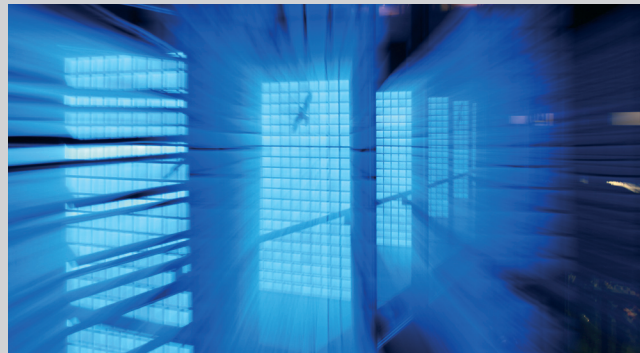
Dynamic Lighting Workshop, Summer 2008, sponsored by ElementLabs

Please register at: www.lightsymposium.de